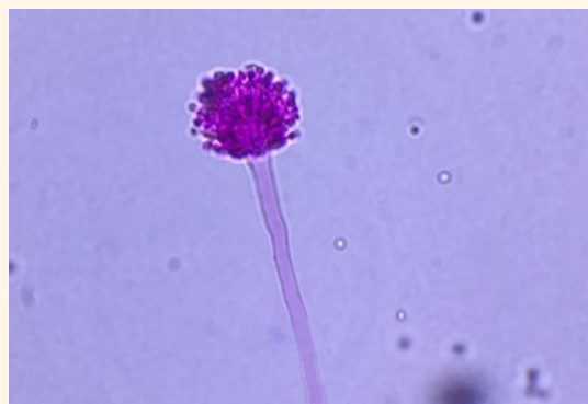
Figure 1: Aspergillus Fumigatus .

For patients at prolonged risk of developing invasive fungal infections, samples may be tested twice weekly as a "screening" test. Specimens may also be submitted from patients, in critical care units, with a prolonged pyrexia which is unresponsive to antibacterials and therefore suspected of having a fungal infection. A sample of clotted serum is required for the test and the turnaround time is 36-48 hours.